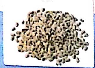
Black eyed beans