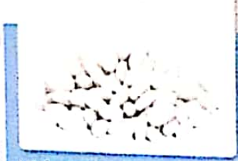
White kidney beans